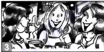
3 in the evening / usually / meet her friends for coffee