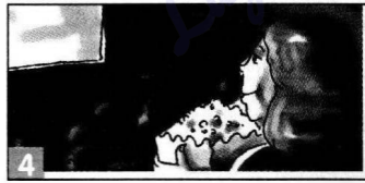
4 once a week / watch a film at the cinema