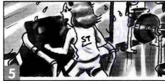
5 rarely / go to the gym