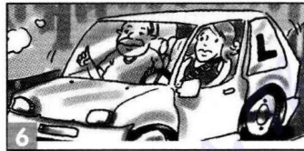
6 have a driving lesson / twice a week