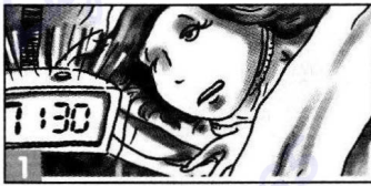
1 every day / get up / at half past seven