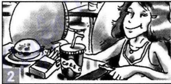
2 often / eat fast food for lunch